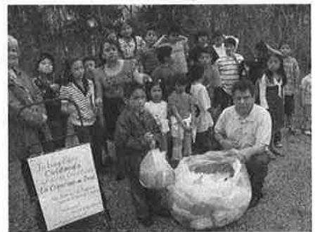
St. Andrews Sunday school group

I was pleased when the bilingual Saturday class from the St. Andrews/San Andres Lutheran Church Sunday School returned to give us a hand on the IPP Geneva Spur. The chaperones and several dozen enthusiastic kids washed over the path like a cleanup tidal wave. I'm sure the Geneva Spur never knew what hit it.