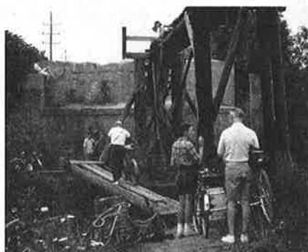
Mid-construction of Bridge 2, the "low" bridge, from the timbers of the "high" bridge

it down. Because the damage to the structure posed a danger to users and to protect The IPPc liability insurance policy, board members cut away both ends of the bridge. Even so, kids kept climbing and playing on it.