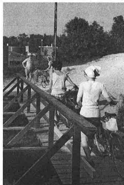
Bridge 3 had one railing.