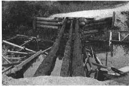
What's left of crispy Bridge 4. Note railings in the water.

the safety issues of the old bridge had been addressed. However, this solution had a short life. Two weeks later, arsonists burned the bridge again and completely destroyed it.