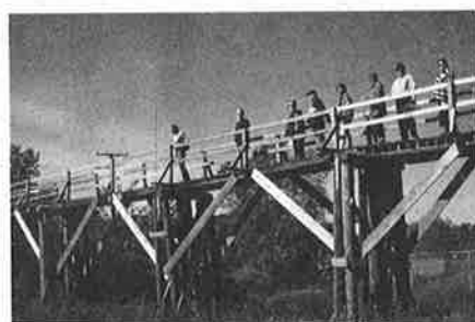
Bridge 1, the "high" bridge

In 1969 the Illinois National Guard built the first or "high" bridge of utility poles and lumber as a training exercise. It replaced the original steel Chicago and Elgin Railroad Bridge which the Aurora