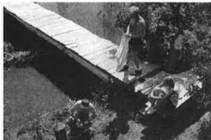
Securing Bridge 2 with a cable