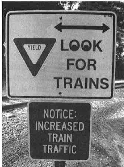
New signs warning Path users of increased EJ&E train traffic.