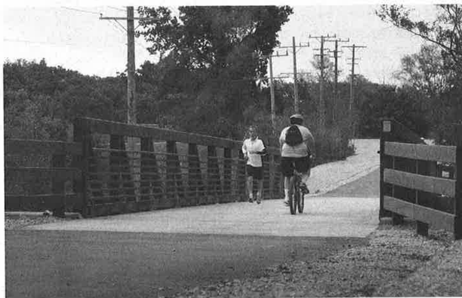
Trail users on new IPP bridge over the East Branch of the DuPage River between Lombard and unincorporated Glen Ellyn